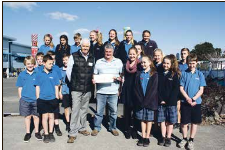
2014: Beachlands School AIMS Games team.

The trust meets to consider applications every month. There's no long drawn out process and applicants will be informed of the decision straight after the meeting, receiving the money within the month.